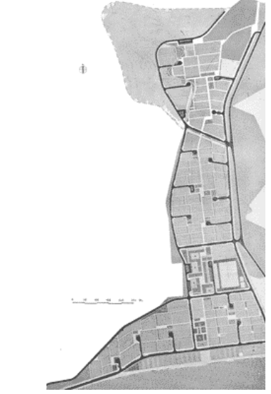
The master plan

This was an easy thing to say. It was more difficult to decide how it could be achieved without reverting to superficial imitation, picturesque trivialities or anachronistic sentimentalities. How could visual richness and individuality of expression be effected without resulting in structural confusion and aesthetic chaos?