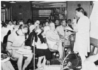
Listening to Vikram Sarabhai speak to the Delos Symposium of 1969

Doxiadis Associates has undertaken hundreds of projects. The most important are mentioned below: