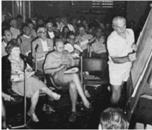
At the board during an early Delos cruise